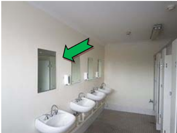
Photo 3. Interior, male and female change rooms, walls – assumed non asbestos-containing fibre cement sheeting.