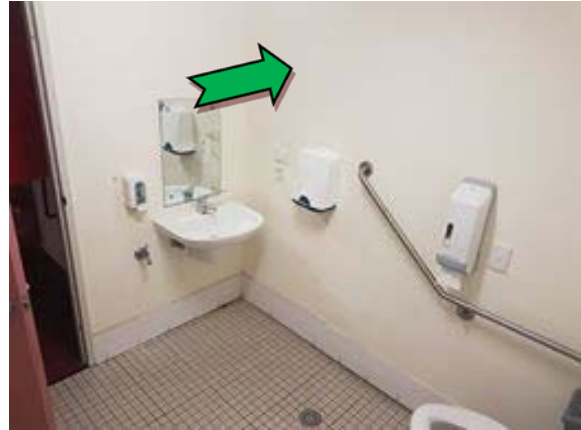
Photo 2. Interior, bathroom, walls – non asbestos-containing fibre cement sheeting.