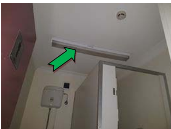
Photo 5. Interior, throughout, single tubed fluorescent light fittings – suspected non PCB-containing capacitors.