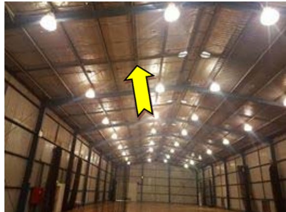
Photo 4. Interior, south elevation, to ceiling – suspected SMF sarking insulation material.