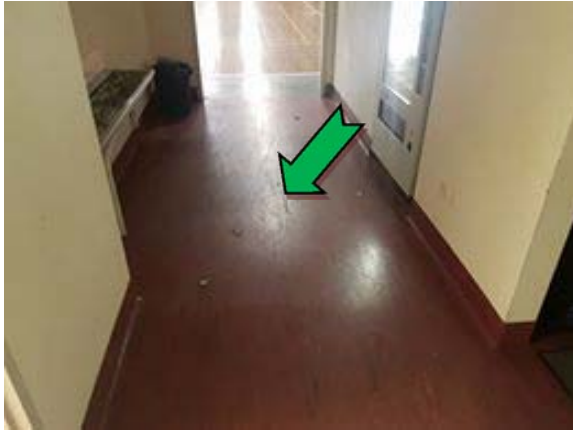
Photo 1. Interior, corridor to kiosk, red floor coverings – suspected non asbestos-containing sheet vinyl.